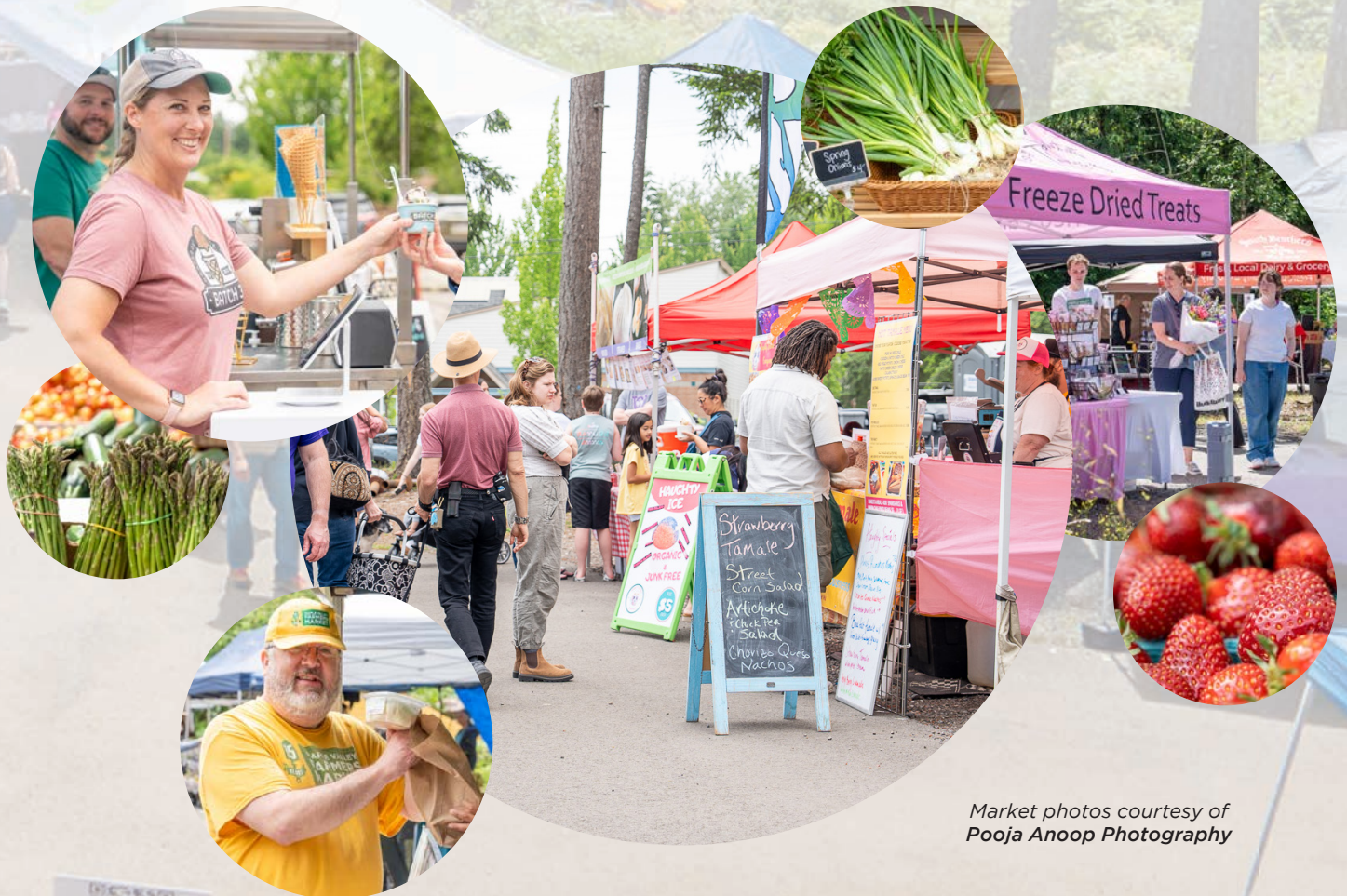
Market photos courtesy of Pooja Anoop Photography