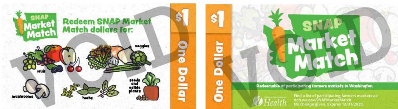
Front side of currency

Currency is printed on tear-proof and semi-water proof paper, and in $1 denomination only . Currency should not be altered or marked in any way.